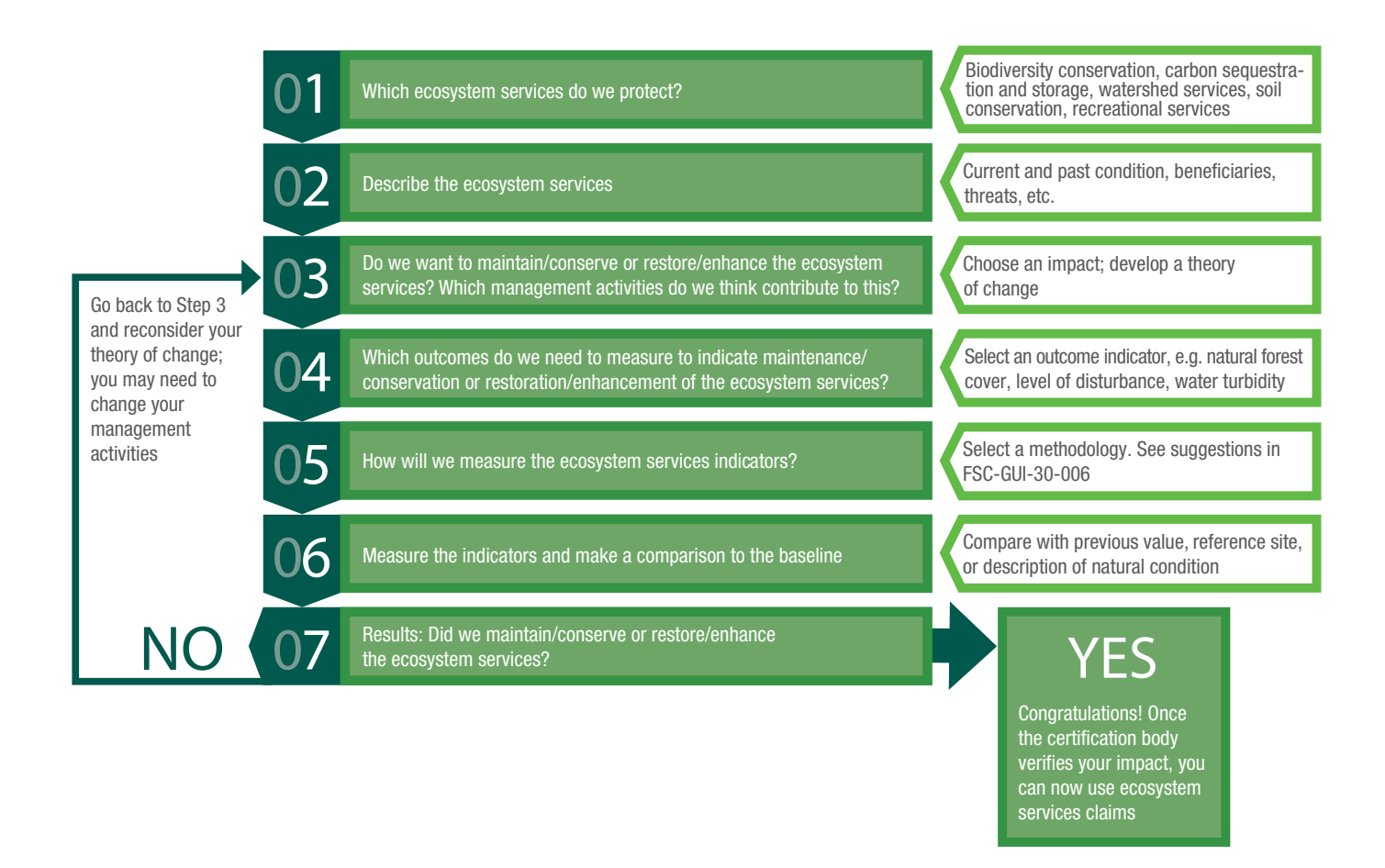
Figure 2. The seven steps required to demonstrate ecosystem services impacts